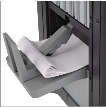
FINISHER UNIT for booklet functionality