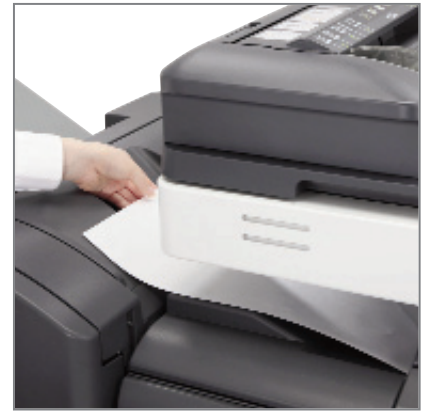
JOB SEPARATOR for printed fax documents