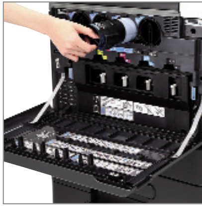
EASY ACCESS for the replacement of consumables